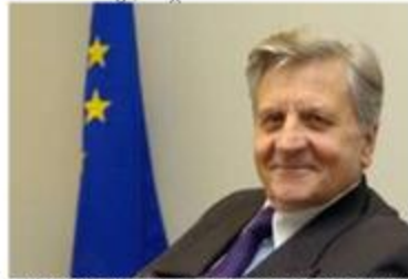
Jean-Claude Trichet, President of the European Central Bank