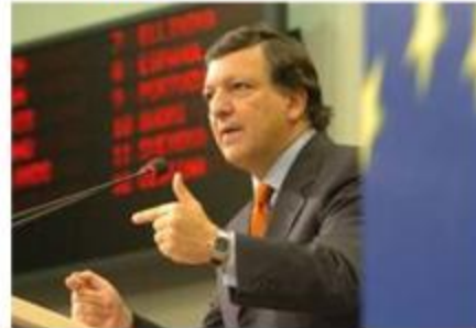
José Manuel Barroso, President of the European Commission