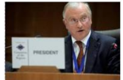
Luc Van den Brande, President of the Committee of the Regions