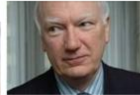
Philippe Maystadt, President of the European Investment Bank